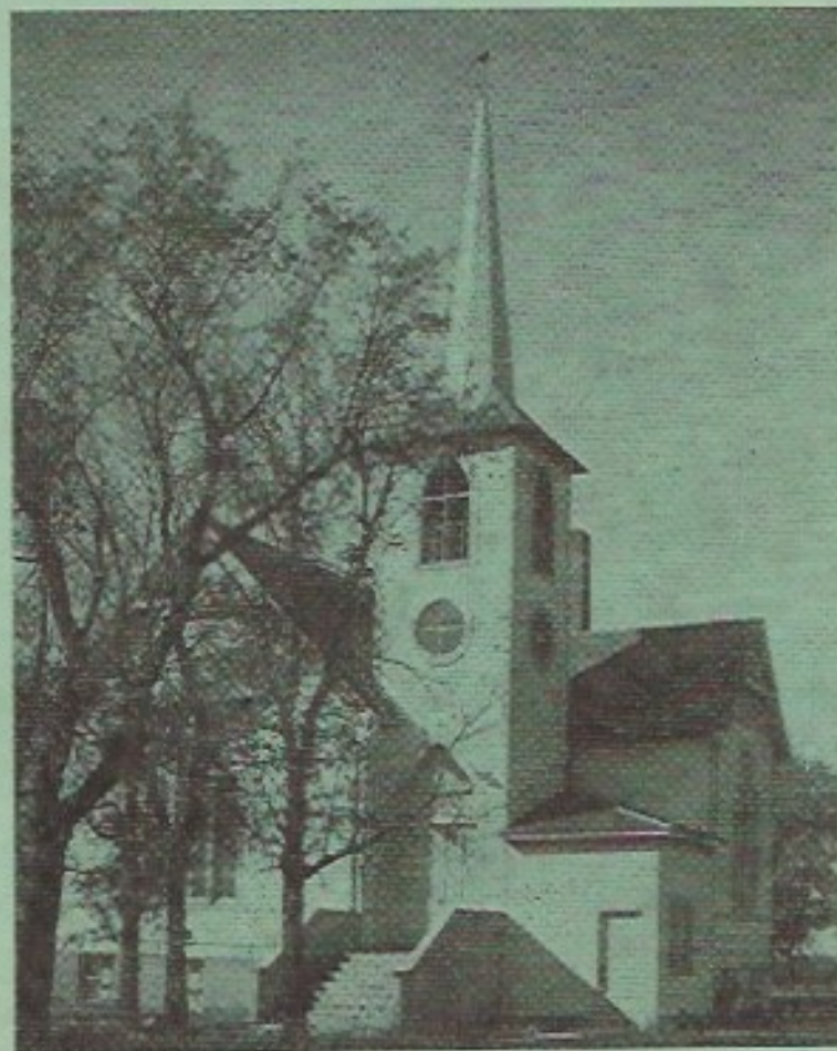
GRUE EVANGELICAL LUTHERAN CHURCH